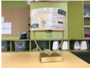
Some other examples of student upcycling creativity!