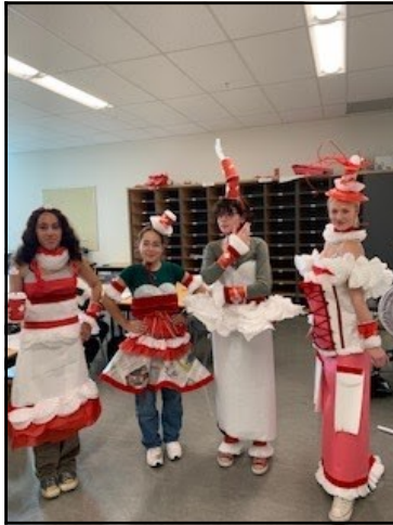
Stagecraft: Costuming and Design

As an introduction to the Design thinking process, students were challenged to create a costume for Tim Hortons, using unconventional materials: coffee cups & lids, stir sticks, coffee filters, red and white paper and craft supplies. Look how creative these students were!