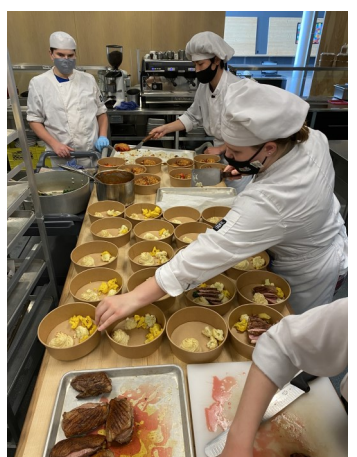
Royal Bay Secondary "HOME OF THE RAVENS!"