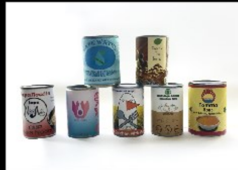
Students designed their own soup can labels with original logos they created using vector software.