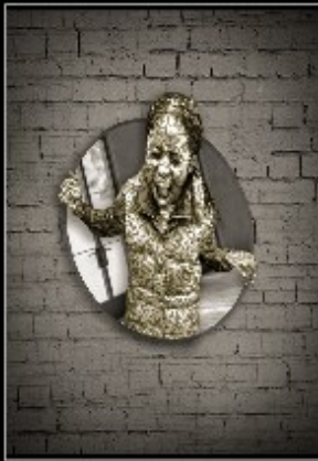
Composite with original photography by Stacey Afiegbe

Digital Art & Photography students created some incredible work during Octa 4 such as stickers, posters, t-shirt designs, digital painting and more!