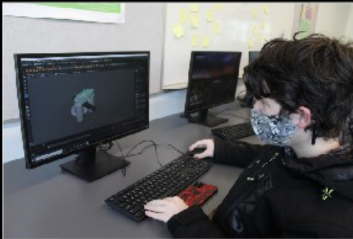
Konnar breaking out the big guns!