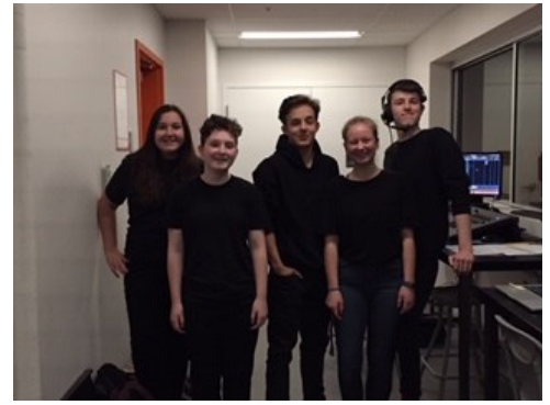
Theatre Production Crew!