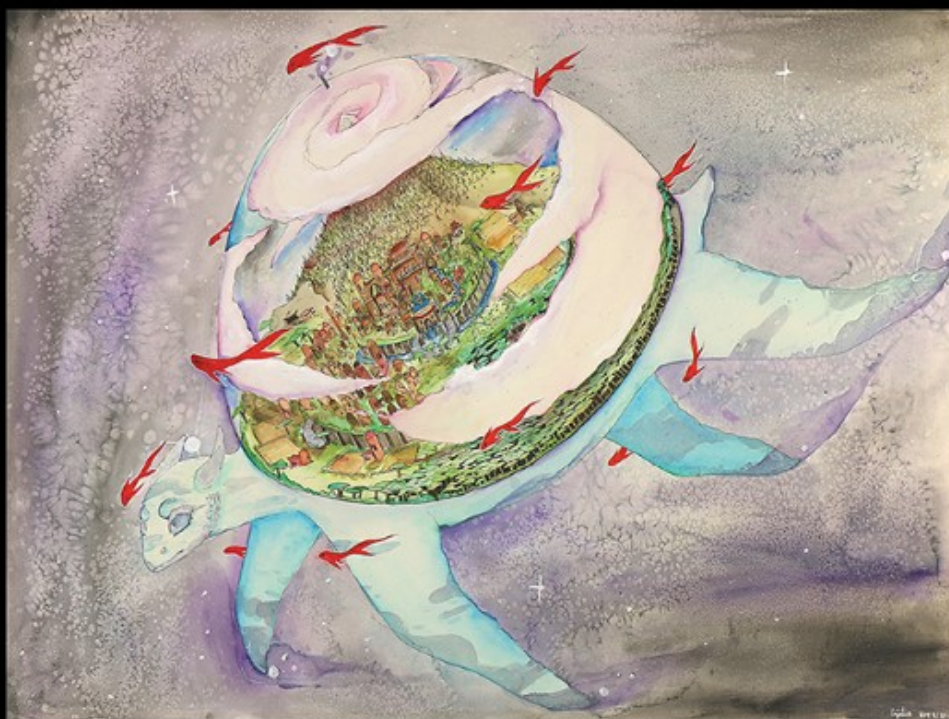
Elliot Walters: "REM City" Ink & Watercolour 22" x 30"