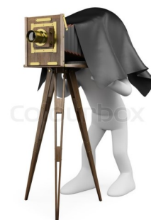
Photo session information is available with the sign up sheets.

Grad photo sign up sheets will be available in the Aviary starting Tuesday, December 4th. There will be no on-line sign up.