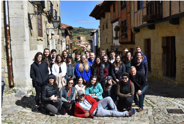
Royal Bay students and teachers in Cantabria Spain, March 2018

For those of you who like to plan ahead (and save money) we would like to inform you about a trip we are planning to the south of Spain for March, 2021. Our last trip to Spain, during spring break 2018, was a wonderful opportunity for students to learn about Spanish culture and to practice speaking Spanish. Some parents suggested that for our next trip it would be helpful to parents if we could start planning earlier in order to lower the monthly cost of the trip. The overall cost, including airfare, hotels, excursion fees, food (except lunches), transportation costs and entry fees for 10 days in Spain is $4014.00 or 29 monthly payments of $136.69 as of September 1st, 2018. In addition, students who enroll before January, 2019, will receive an additional $300 off with the code Haddon300.